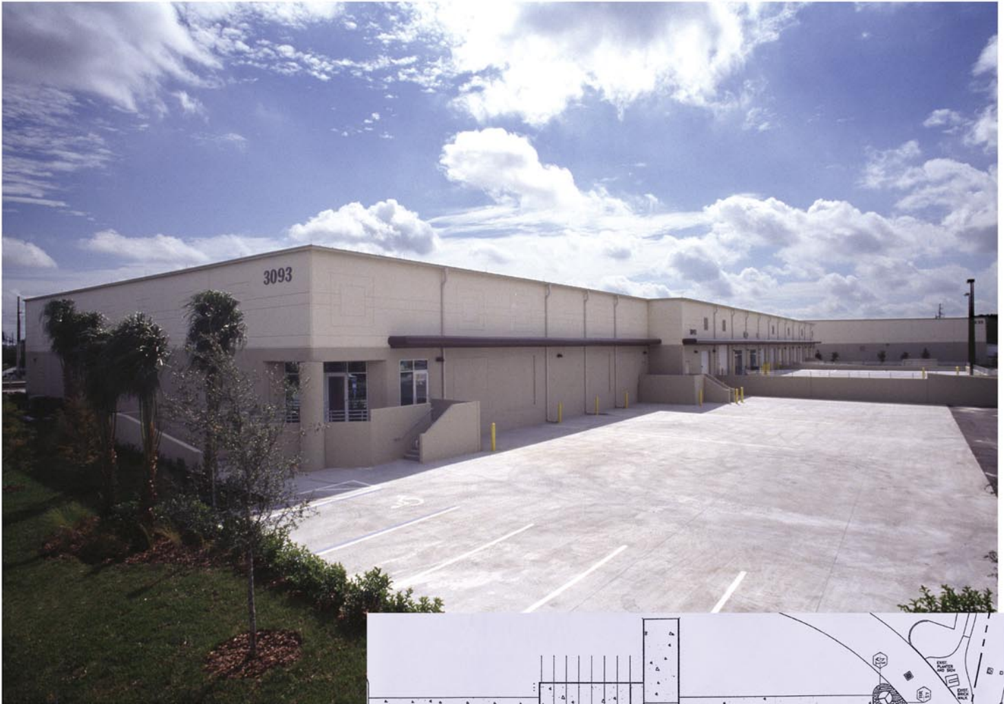
3093 Caruso Court